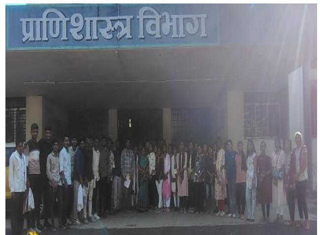
Spider Museum @ Department of Zoology SGBAU Amravati