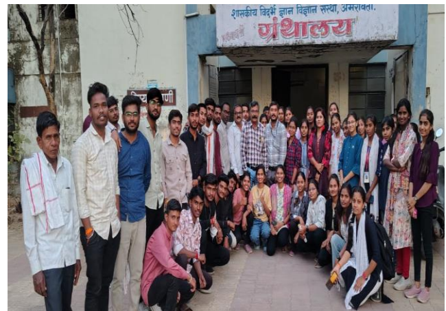
Visit to Library @ VMV College