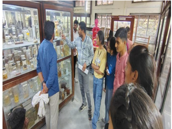
Department of Zoology Museum @ VMV